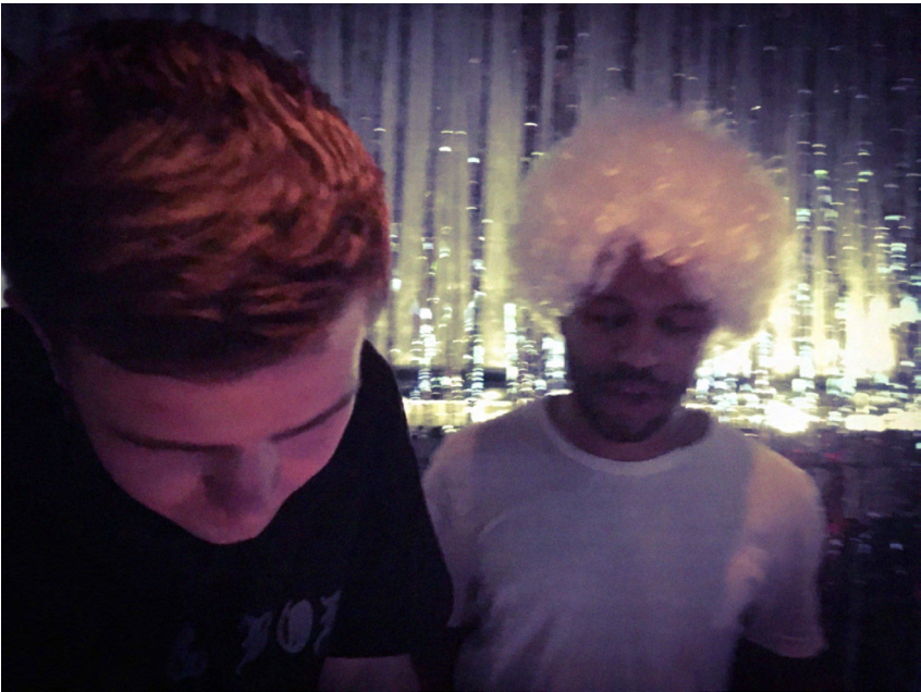
Festival Club: Dazzle and Bling