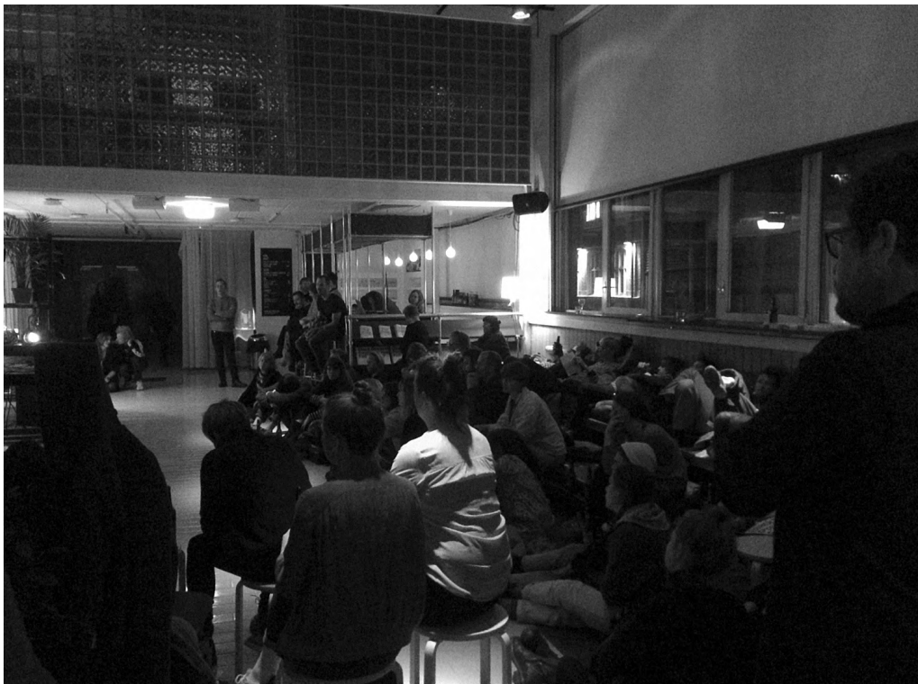
Seminar at Black Box teater