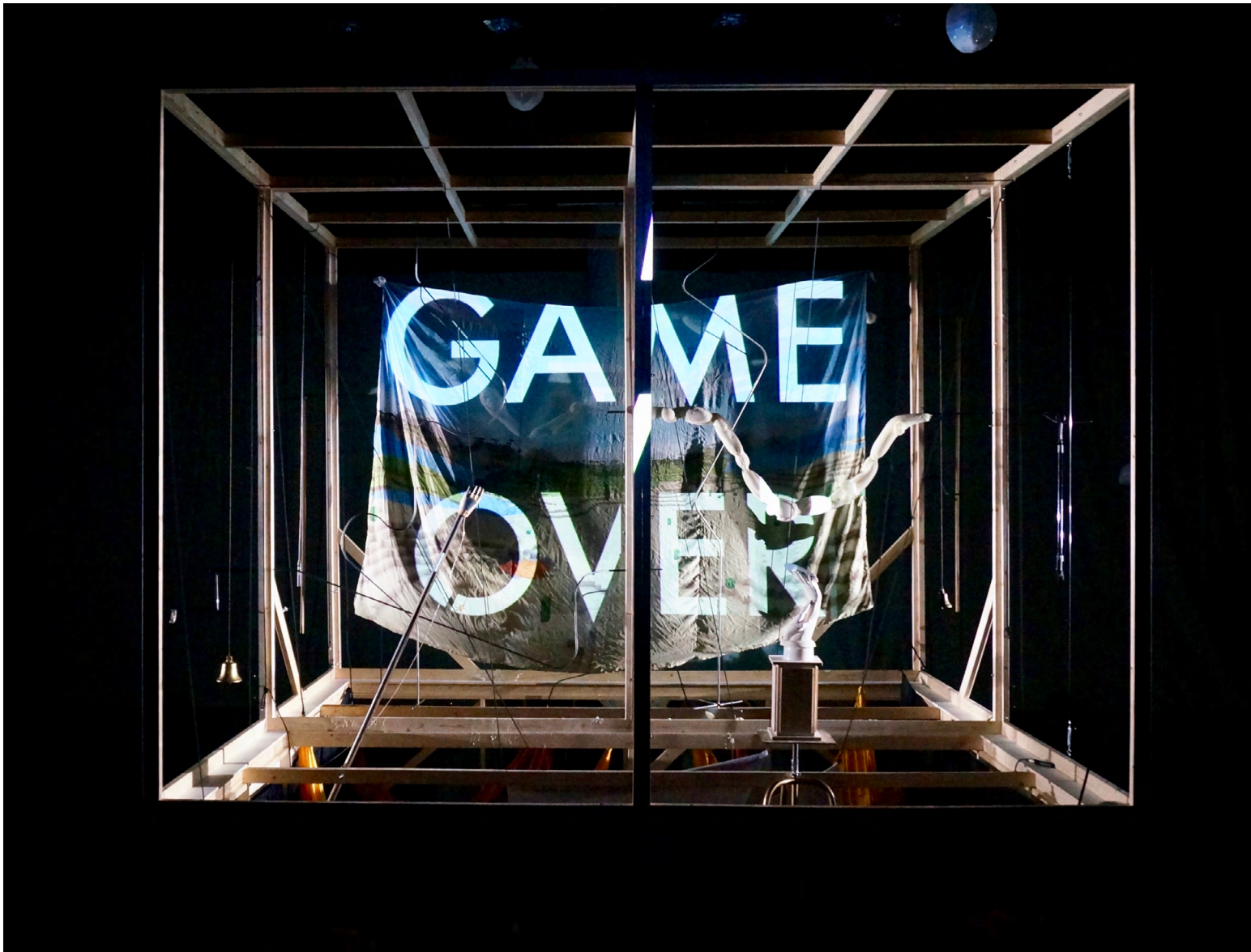
Eirik Fauske, Live – Sorgarbeid