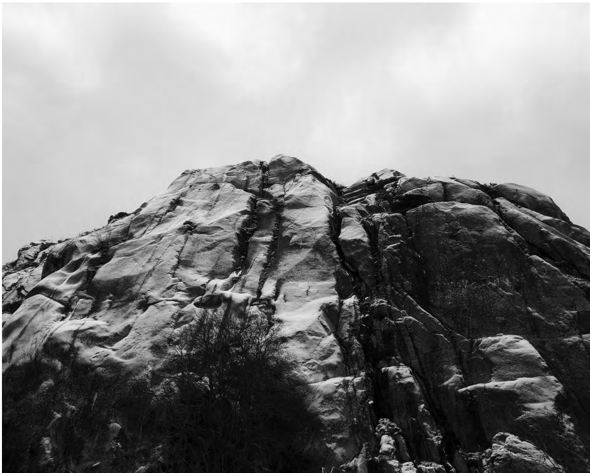
Tormod Carlsen, Radio Oh So Slow