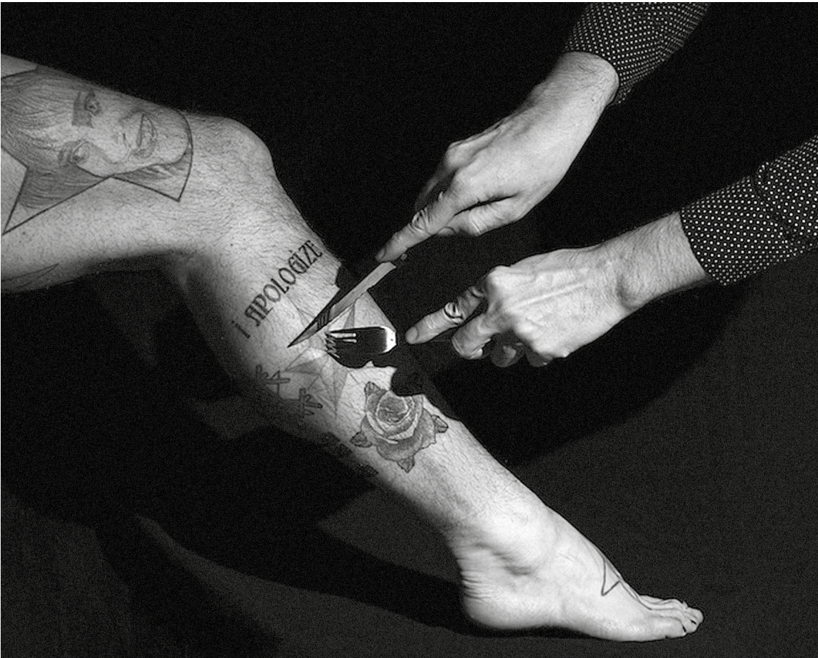
I Apologize, Concert