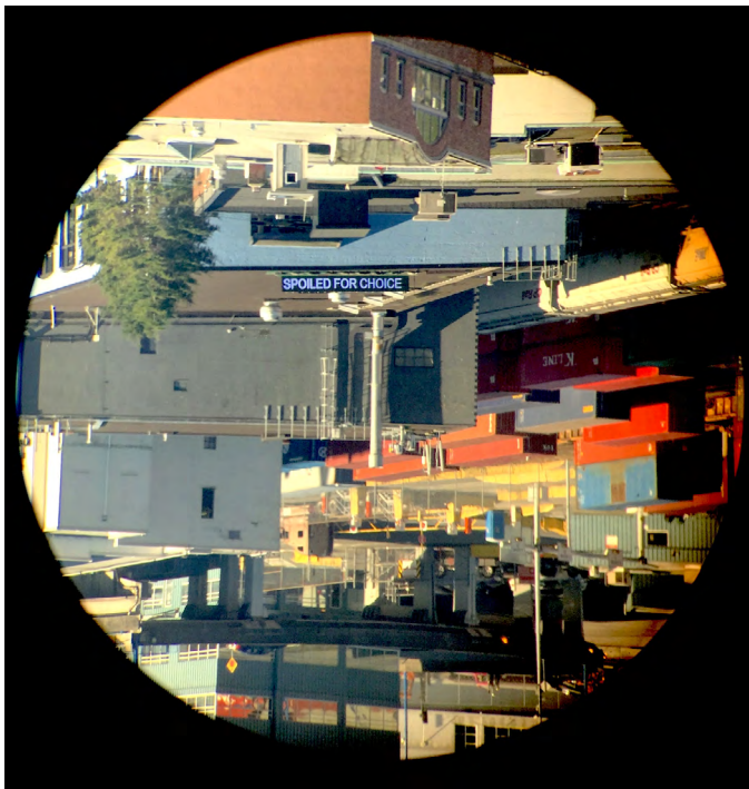
Dries Verhoeven, Fare Thee Well!